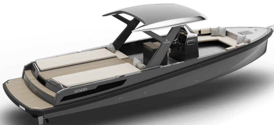
3D rendering of HYNova 40 "The New Era"