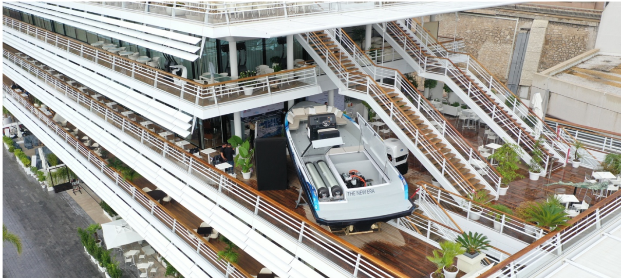
The New Era prototype from Hynova Yachts on the decks of Yacht Club de Monaco, where the REXH 2 and its Hexagon hydrogen tanks are visible