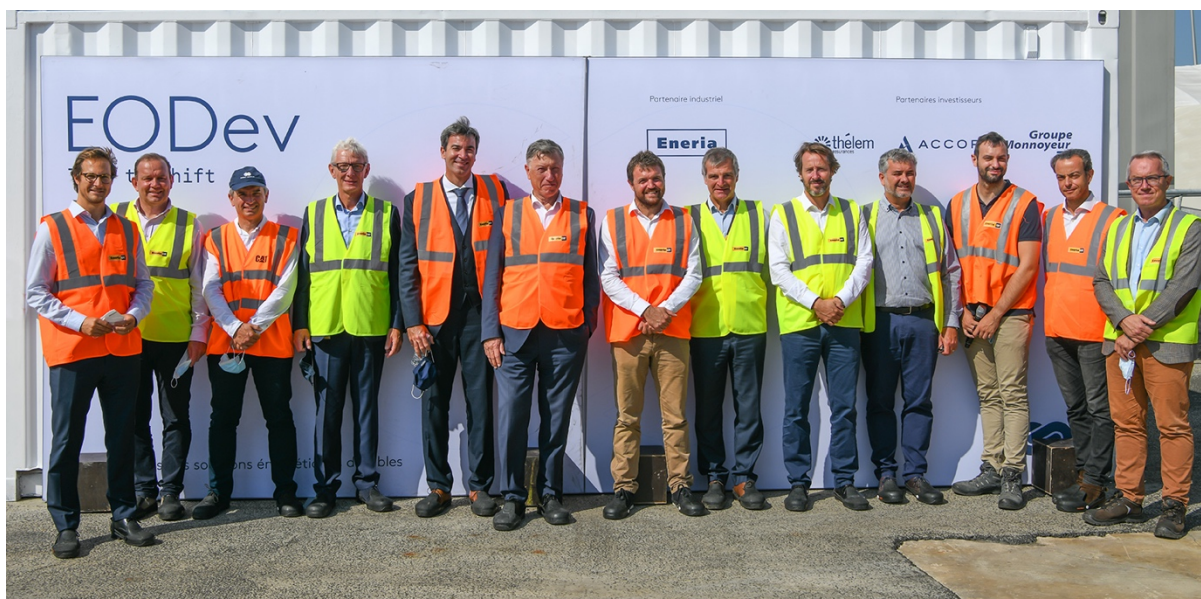
Directoes, partners and shareholders gather for a family portrait at Energia's site in Montlhéry in september 2020