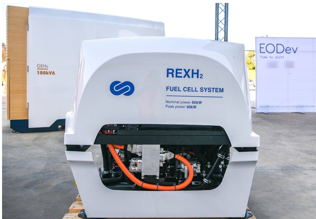
The REXH2 in the foreground, with the GEH 2 in the background