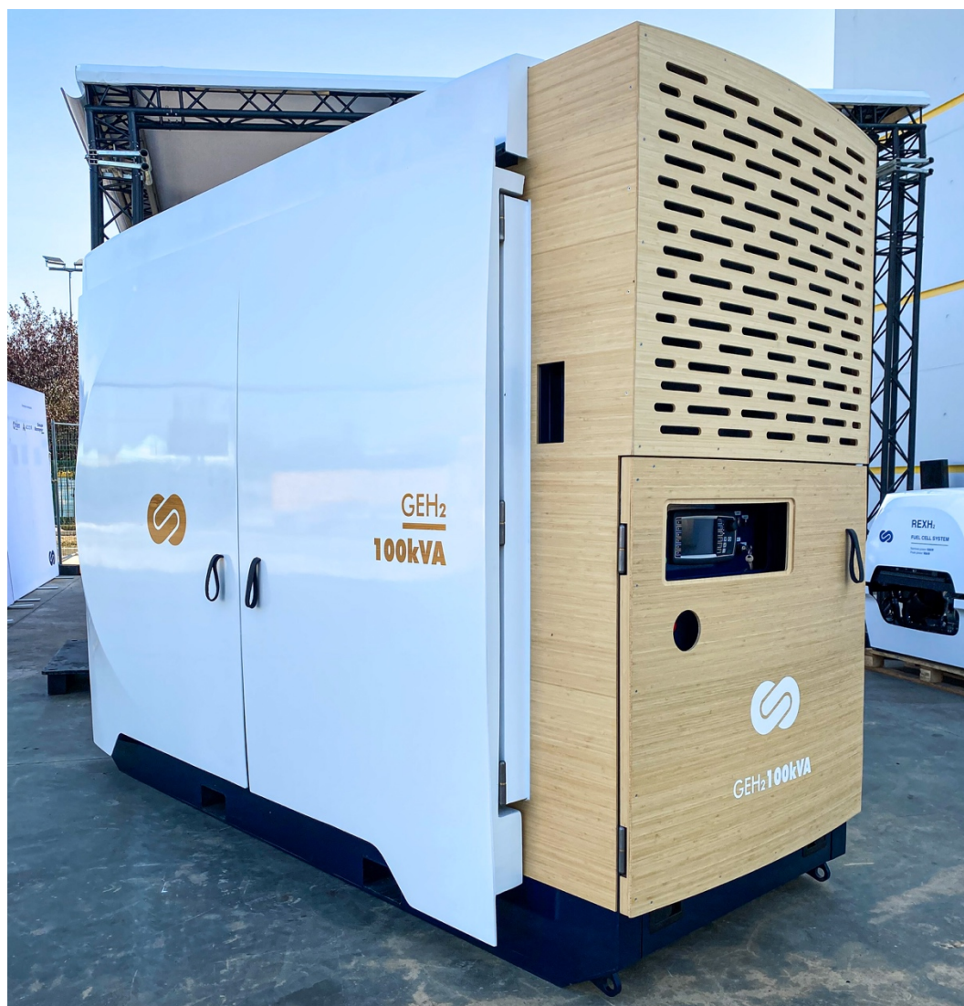
The GEH 2 ready to be turned on