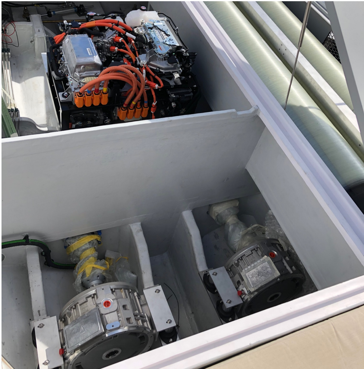
The New Era prototype of Hynova Yachts with its REXH 2 , its BorgWarner electric engines and Hexagon hydrogen tanks