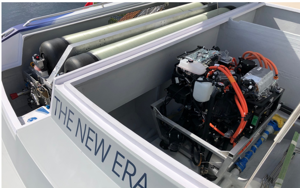
The New Era prototype of Hynova Yachts with its REXH 2 and Hexagon hydrogen tanks